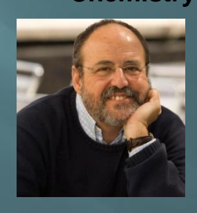
Ernest Giralt Peptides