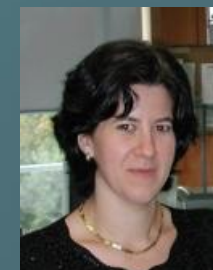
Eva Töth Imaging