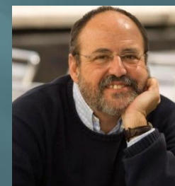
Ernest Giralt Peptides